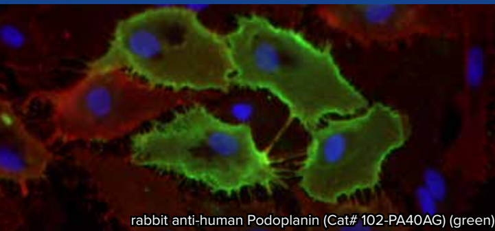
rabbit anti-human Podoplanin (Cat# 102-PA40AG) (green)